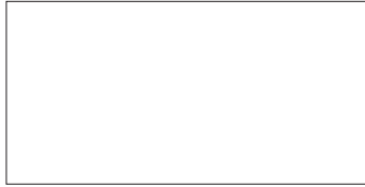
White 452-P (LRV-90)